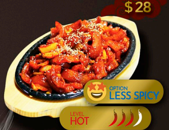
매콤 돼지 껍데기 SPICY PORK RINDS

Stir-fried chewy pork rinds bathed in a luscious chilli sauce. Savor the perfect harmony of textures – tender and chewy – alongside a spicy.