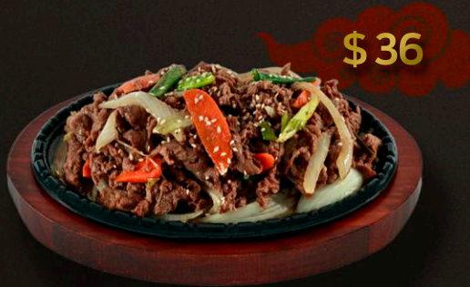
꽃등심 구이 🍲🍛🍲 KKOT-DEUNGSIM-GUI