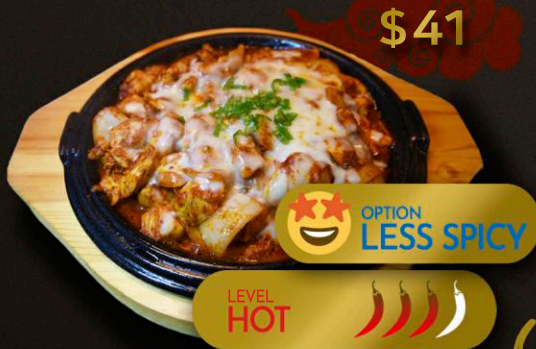
치즈 불닭 CHEESE BUL-DAK