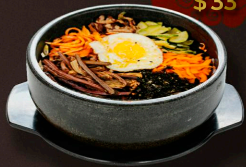
소고기 돌솥비빔밥 🍲 🍲 BEEF DOLSOT BIBIMBUB