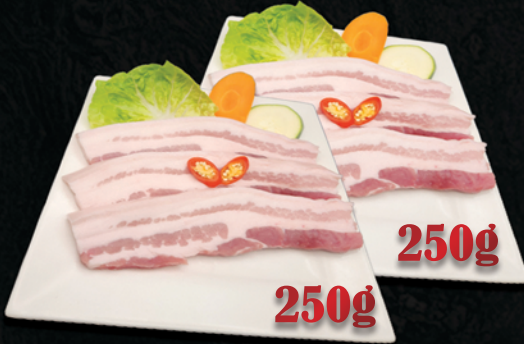
삼겹살 X 2 PORK BELLY X 2

Juicy, tender pork belly, aged to perfection, grilled over charcoal for an irresistible smoky flavor. Korean No.1 BBQ sensation for your taste buds.