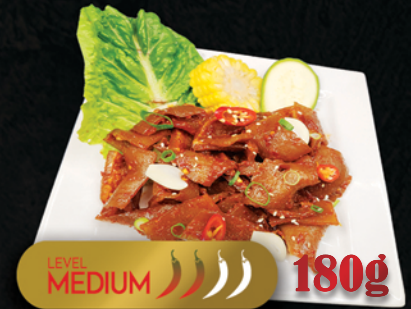
돼지 껍데기 SPICY PORK SKIN

Crispy and chewy pork skin, infused with spicy marinade, grilled over charcoal to perfection. An addictive, bold, and flavorful BBQ delight.