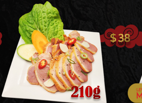
훈제 오리 SMOKED DUCK

Succulent chicken, marinated in authentic Korean flavors, grilled over charcoal for a smoky, tender, and mouthwatering dining experience.