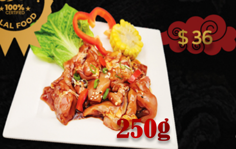
양념 닭고기 MARINATED CHICKEN

Succulent chicken, marinated in authentic Korean flavors, grilled over charcoal for a smoky, tender, and mouthwatering dining experience.