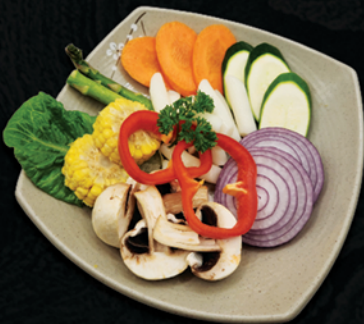
야채 모듬 ASSORTED VEGETABLE

Juicy Scotch fillet marinated in traditional Korean garlic soy sauce. An authentic, mouthwatering delight that embodies the spirit of cuisine.