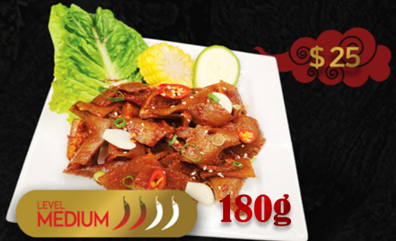
돼지 껍데기 SPICY PORK SKIN

Juicy, tender pork belly, specially aged for perfection, grilled over charcoal for an irresistible smoky flavor. A BBQ sensation for your taste buds.