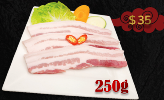
삼겹살 PORK BELLY

Juicy, tender pork belly, specially aged for perfection, grilled over charcoal for an irresistible smoky flavor. A BBQ sensation for your taste buds.