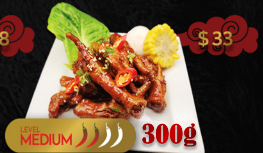
닭발 SPICY CHICKEN FEET

Indulge in our exquisite Smoked Duck BBQ Plate, a fusion of rich flavors. Tender smoked duck paired with traditional Korean BBQ elements.